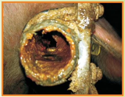
Condition of a pigsty conduit

Water molecules form clusters, which enclose ingredients. Through electromagnetic pulses, these clusters can be manipulated.